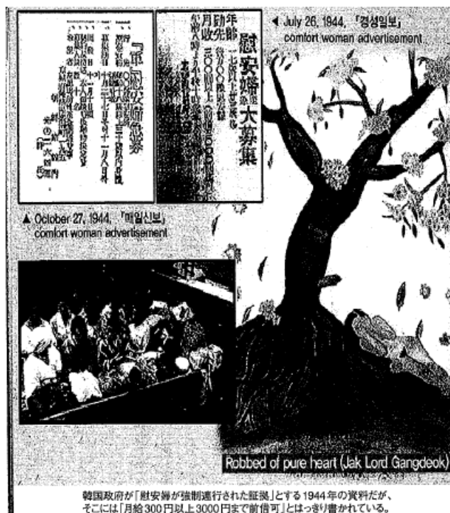
Fig. 1: Source material released by the Korean government in an attempt to demonstrate that Korean women were coerced into serving as comfort women; strangely enough, it includes newspaper advertisements for comfort women (see Fig. 2)

Prior to World War II, Japan never attempted to conceal or control information about the existence of military prostitutes. In fact, recruitment notices appeared in newspapers (see Fig. 2). Private brokers made strenuous efforts to recruit them, for obvious reasons. At that time prostitution was legal in Japan, just as it was in most of the world’s nations. It was therefore not at all unusual to establish brothels in battle zones. That is why Korea’s leading newspapers carried advertisements intended to attract women to work in those brothels. It is also common knowledge that a large number of Korean women worked in war zones as military prostitutes.