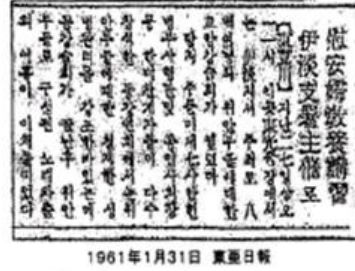
Fig. 4: Articles from Dong-a Ilbo dated January 31, 1961 (left) and September 14 of the same year (right) about Korean government establishing brothels for American GIs

patronize a prostitute, but they are in for a huge surprise. They are still doing what Japanese military personnel were doing during World War II. The only difference is how the prostitutes were hired (domestically or locally).